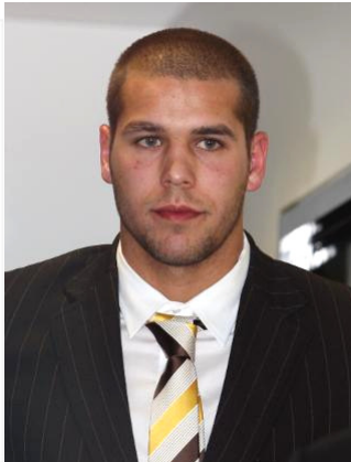
A special one for Hawthorn FC fans from August 2009...two pictures of a 'suspended star'!