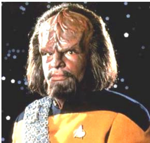
Shoab Akhtar moments after receiving some really, really bad news from his Doctor (“ please tell me you said gentle sports, Doc!? ”) and a Klingon .