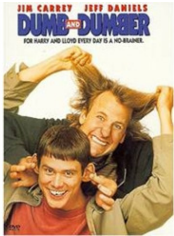
Dude, Where’s My Car-eer? Kyle Sandilands and Jackie O - giving ‘trash’ a bad name!

THE END. SIX LEGITIMATE DELIVERIES (OVER).