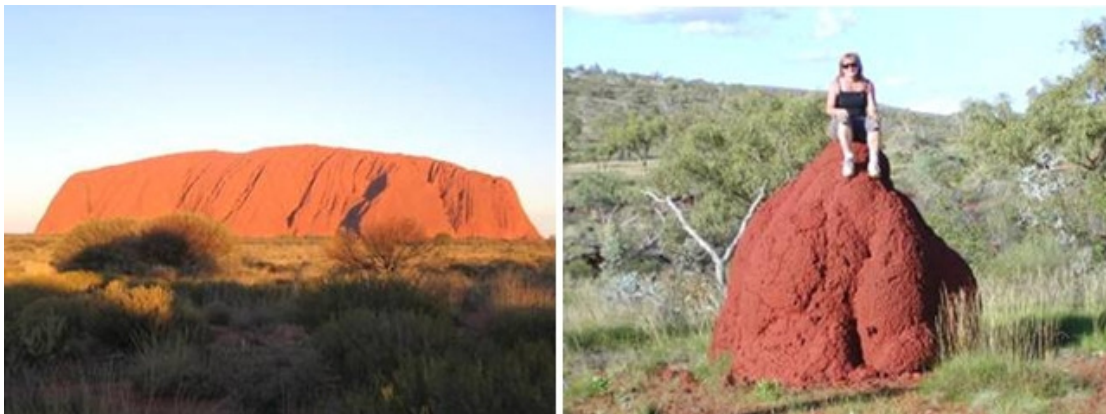
Ayres Rock...before and after the great red dust storms of earlier this week?

It was as if the surface of the planet Mars had been dissipated across the Australian east coast, or if the mighty Ayers Rock had been reduced to dust and then blown right across our great land.