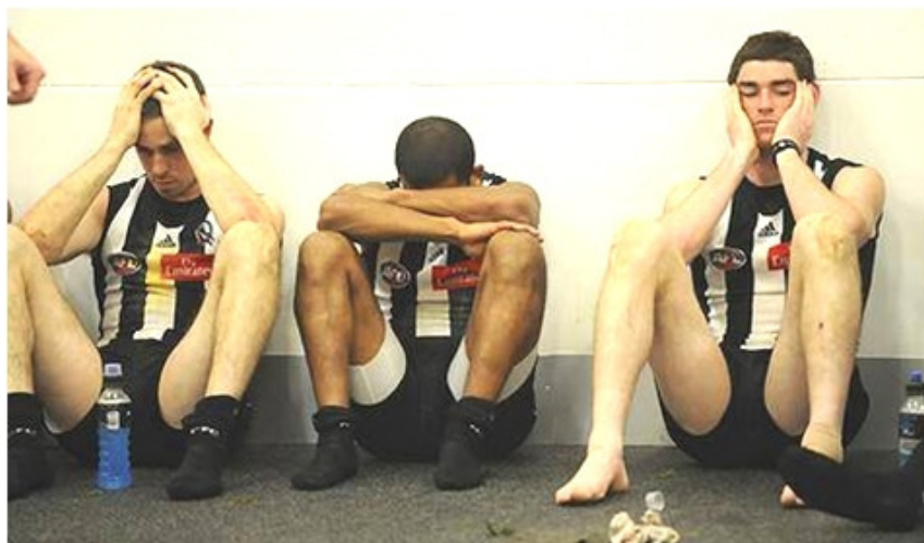
Cold Pies – downcast and devastated players after being informed they have actually been retained by their Club for 2010.