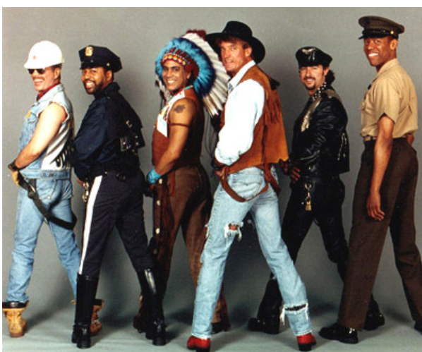
The Village People are rumored to be soon reforming...in Tennant Creek of all places!