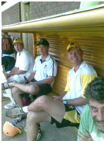
D-Dream Believer... a possible D-Grade line-up in 2010??