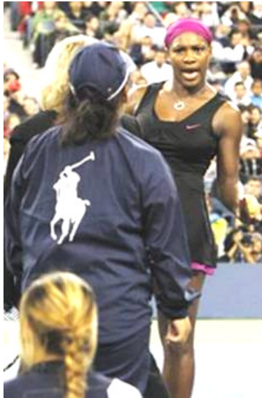
Serena shocker... “ I'll give YOU a foot fault, sister! ”

“ I used to have a real temper, but I've gotten a lot better ” Williams said during her post-match interview. A serener Serena...good to see you didn't lose your cool or anything sister, now that would have been really embarrassing on international television!